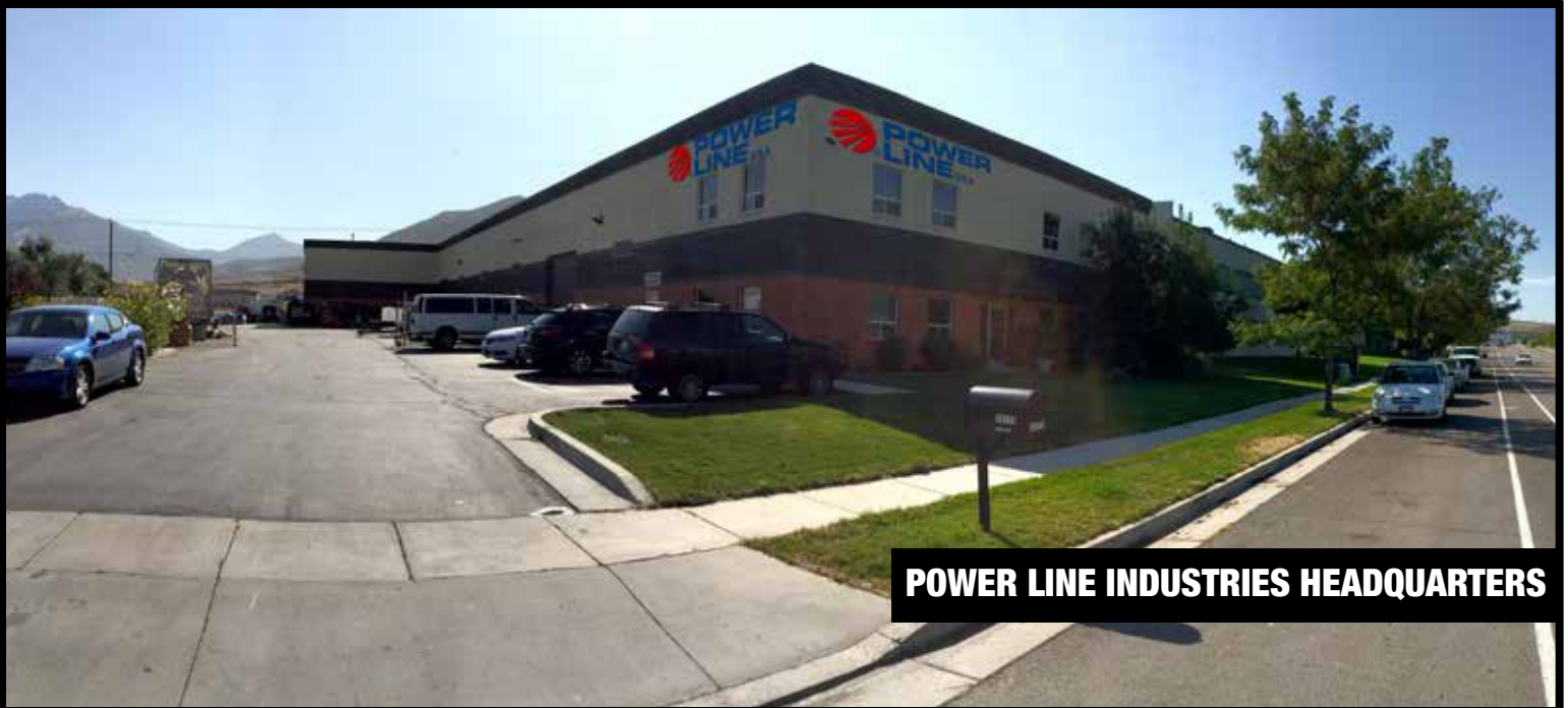
POWER LINE INDUSTRIES HEADQUARTERS